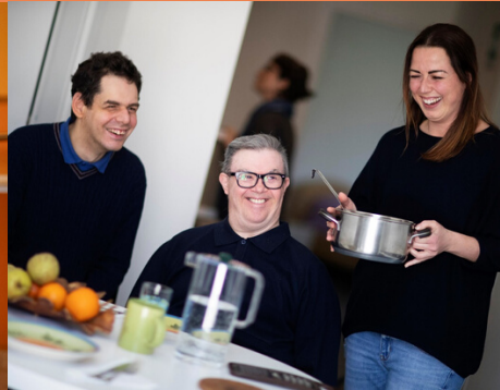
Eating all together